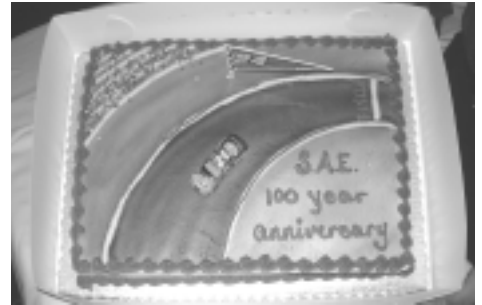
SAE 100-Year Anniversary cake was a special treat made specially for our Section