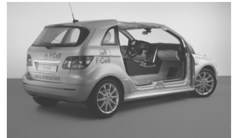
DaimlerChrysler's new fuel cell car introduced at the Geneva Autoshow.

Thanks to a reduction in fuel consumption and a further enhanced storage capacity, the operating range has now been increased to almost 400 km (250 miles). The components' reliability and longevity have also been further improved.