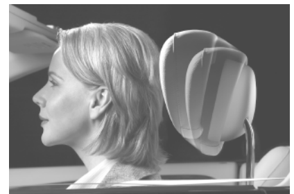
New crash-responsive head restraint is standard equipment on some Mercedes cars.

The new crash-responsive head restraints for the driver and front passenger are standard equipment in the C-Class Saloon and Estate, the CLK-Class Coupé and Cabriolet, The E-Class Saloon and Estate and in the four-door CLS Coupé.