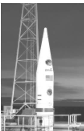
Target Launch Vehicle (TLV) in silo.