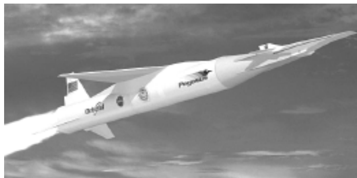
Artist rendering of Orbital's Hyper-X in flight

ers and combines decommissioned Peacekeeper rocket motors with proven Orbital avionics and fairings to provide increased lifting capacity for government-sponsored payloads.