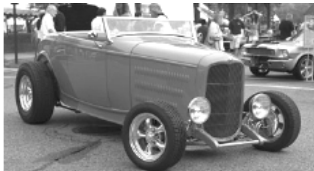
Dearborn Deuce

American Specialty Car, Inc (ASC), is offering a fully-made ready-to-drive 1932 Ford hot rod, the Dearborn Deuce. The Dearborn Deuce has a steel body, 355-horsepower