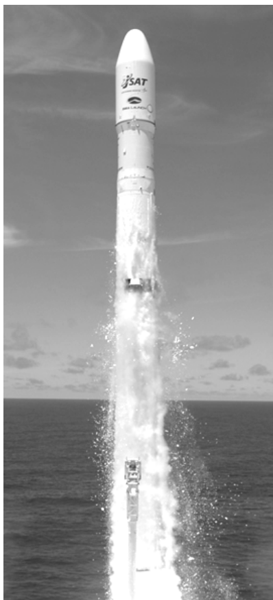
Launch of JCSAT-9

Sea-Launch is a consortium of 4 international corporations who work together to launch Satellites into a Geostationary transfer orbit above the earth using an ocean-going rocket launch platform. Sea-Launch is based in Long Beach, California and is one of the most unique Corporations in the World.