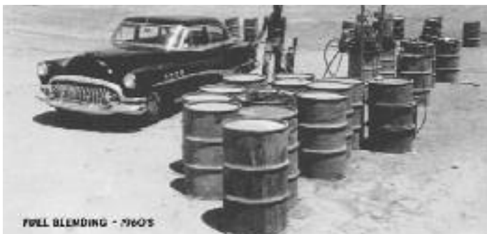
General Motors Desert Proving Grounds in 1960's