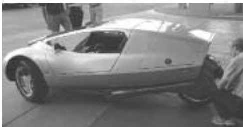
XR3 in front of Hilton hotel lobby before presentation.

First, the XR3 Hybrid is a super-fuel-efficient two-passenger plug-in hybrid that claimed 125 mpg on diesel power alone, 225 mpg on combined