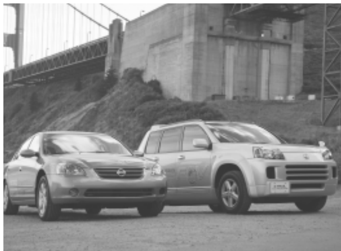
Nissan Altima Hybrid planned for introduction in 2006 (left) and X-Trail Fuel Cell Vehicle (right).

Hybrid vehicles available today are mostly equipped with rather small motors focused on environmental performance. However, the Altima Hybrid is a breakthrough model, which provides new feeling of driving pleasure to customers with its dynamic acceleration performance, while minimizing the impact to the environment at the same time.