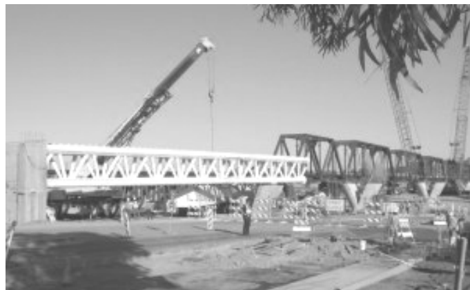
Tempe Town Lake Bridge under development for the Valley Metro Rail.